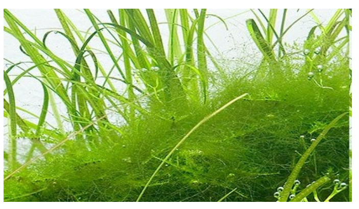
Fig. 3. Green algae Cladophoraglomerata, C. rupestris, Enteromorphaspp

Each group of raw materials was carefully weighed by weighing the sample and inoculum and afterwards thoroughly stirred. For all samples the same inoculum-digestate was used from the continuous operation bioreactor.