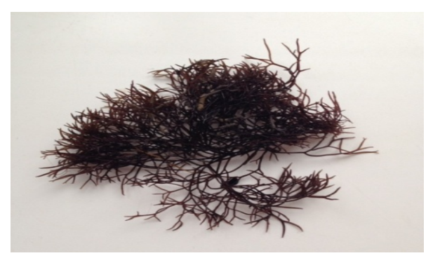
Fig. 1. Brown algae Fucusvesiculosus